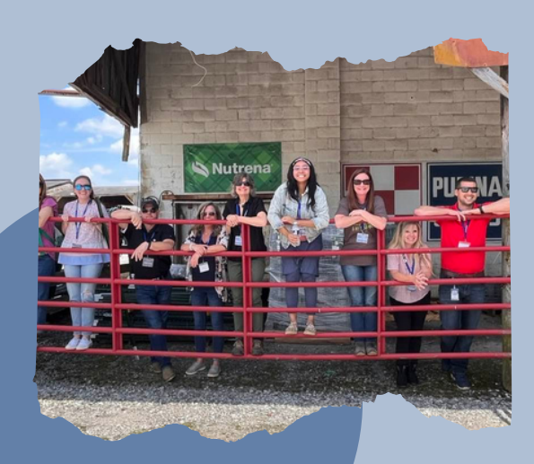
Upper Cleveland Day

email Kathryn@clevelandcountychamber.org