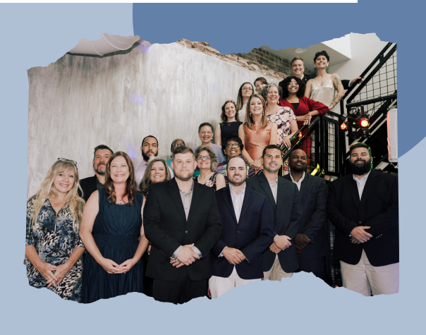
Graduating Class of 2023